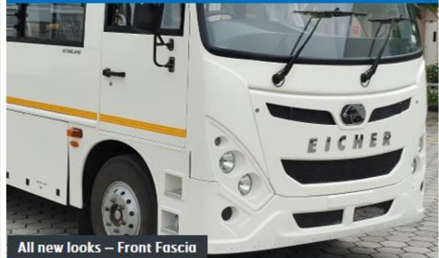
All new looks – Front Fascia