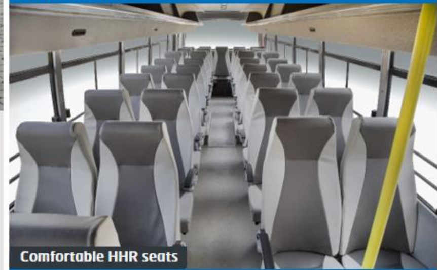
Comfortable HHR seats

Starline buses offer option of premium pushback seats and comfortable HHR seats with increased suspension span for superior ride-comfort. The complete range is available with AC option and features like USB charging ports and individual AC vents that makes the Starline Executive range the best transport solution for staff application.