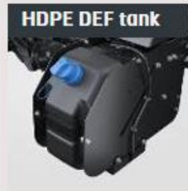
HDPE DEF tank