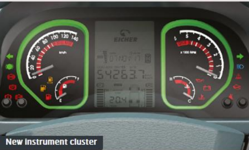
New instrument cluster

Eicher Live lets you track your vehicle and glance at vital performance parameters at the touch of a button. Fuel coaching and Mbooster+ enables the driver to operate the bus in the most fuel efficient manner. The Intelligent driver information system keeps the driver informed of all the key parameters through an easy to read display and tell-tales.