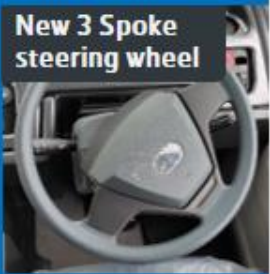
New 3 Spoke steering wheel