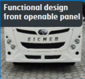
Functional design front openable panel