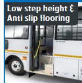
Low step height & Anti slip flooring